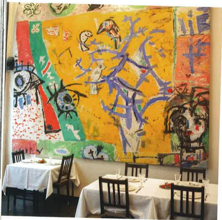
Above, bright and breezy El Continental Bistro on Calle Simon García. Bottom, miniature bikes, anyone?