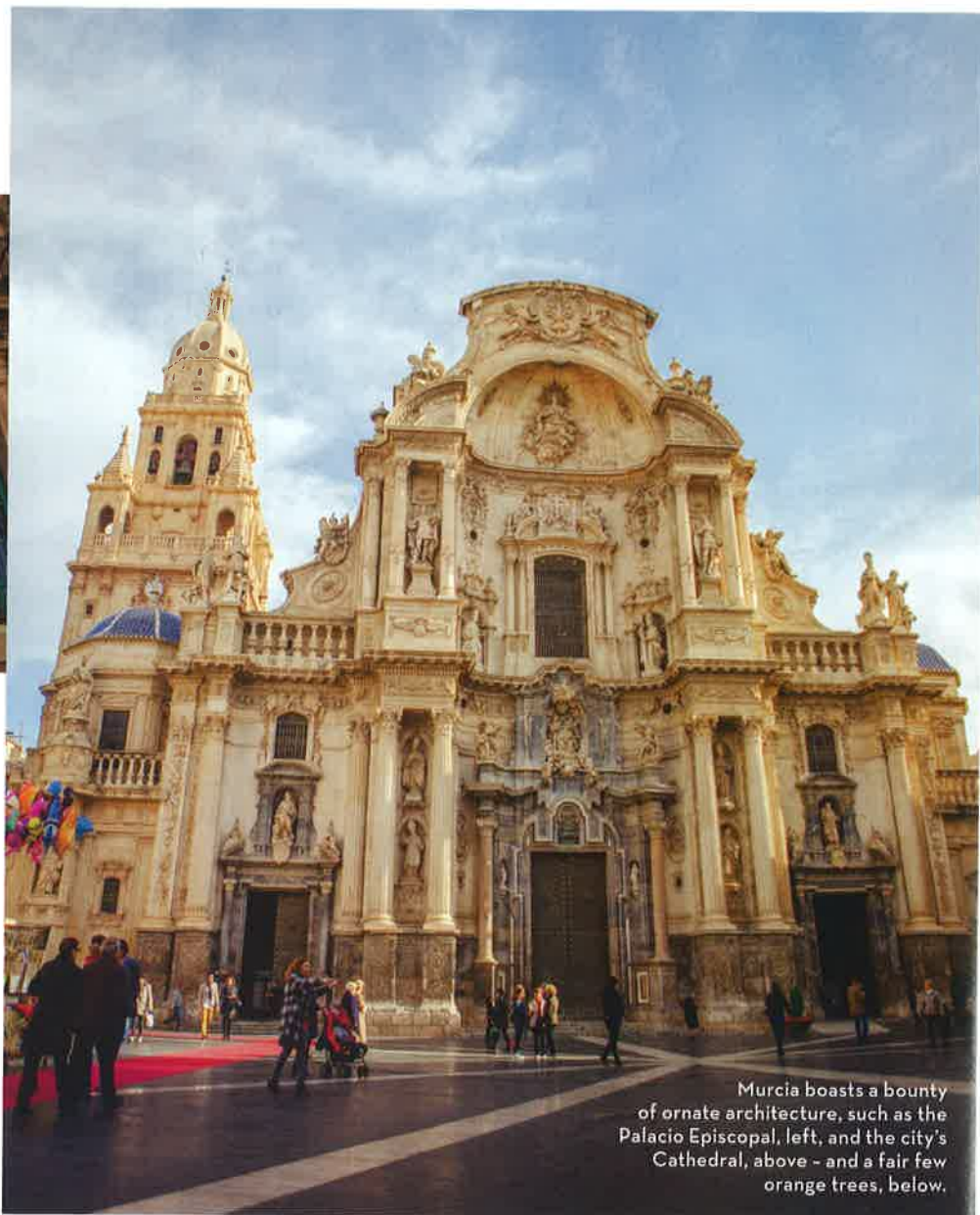
Murcia boasts a bounty of ornate architecture, such as the Palacio Episcopal, left, and the city's Cathedral, above – and a fair few orange trees, below.

It's not difficult to see the attraction of this part of Spain, with its hot, subtropical, semi-arid climate and 300 days of sunshine;