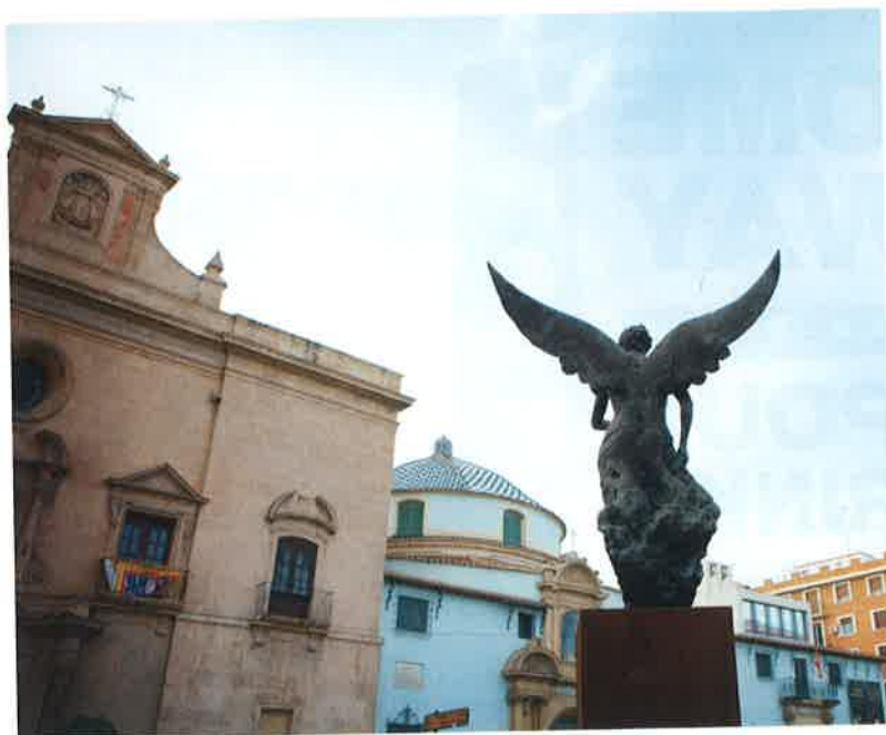
Wing and a prayer - a statue overlooks the Museo Salzillo, left. Above right, patron-sainting and, below, Paparajote Factory design inspo at boutique La Post Street. Bottom, Murcia skyline is a surprise from every turn.